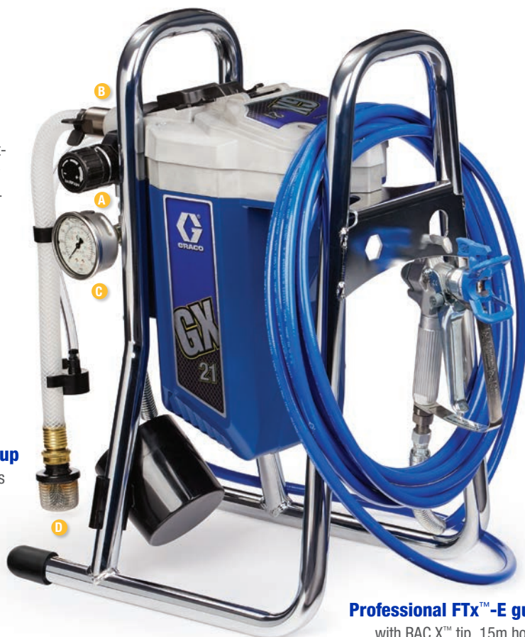
Professional FTx™-E gun with RAC X™ tip, 15m hose