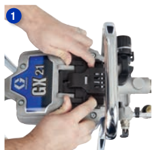
Slide & lift open access door