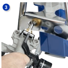
Use frame hex fitting to loosen pump and remove cartridge