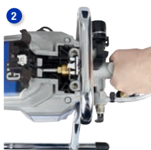
Remove pump section