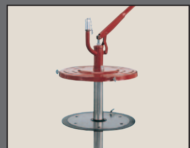
Grease Gun Fill Pump