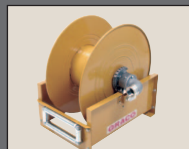
750 Series Hose Reels