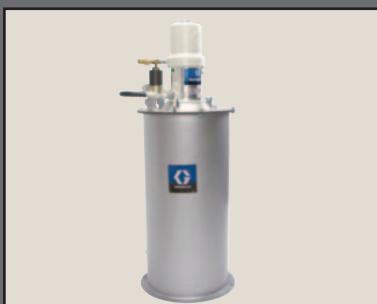
Fire-Ball™ Pump Package with reservoir