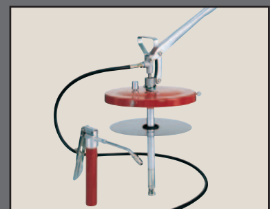
BuckShot Luber with Booster Gun