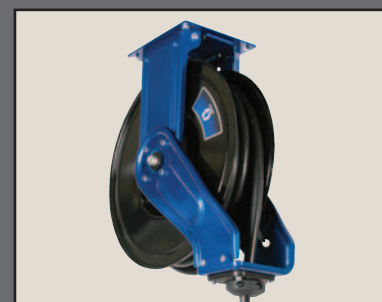
XD 30 Hose Reels