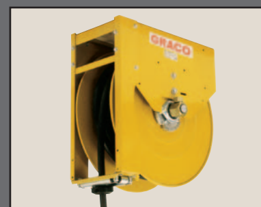
700 Series Hose Reels