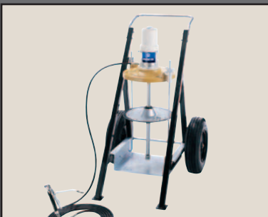
Air-Operated Grease Pumps and Packages

No matter what your needs and requirements are, Graco has a solution for you with our wide range of equipment in open cast and underground mining operations.