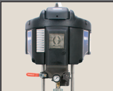
NXT™ Pumps and Packages

Looking for more detailed info? See our Lubrication Pumps brochure 340673