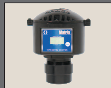
Tank Level Monitor