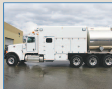
Lube Service Trucks