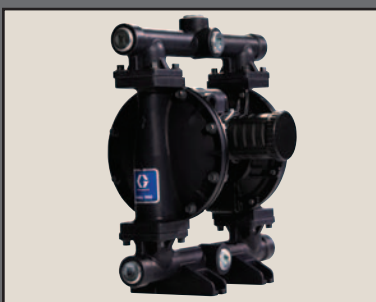
AODD Pumps and Packages