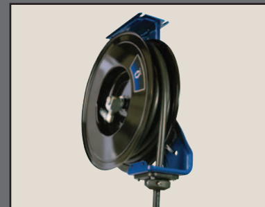
SD Hose Reels

Looking for more detailed info? See our Hose Reel brochure 340309