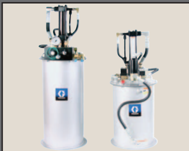
DynaStar™ 10:1 with reservoir