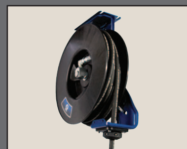
XD Hose Reels