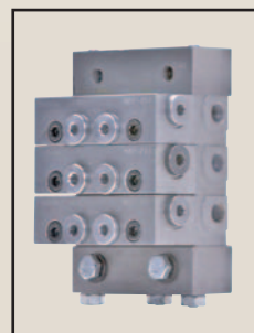
MSP Divider Valves