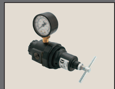
Oil & Grease Filtration