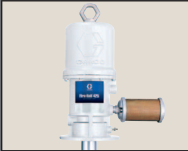
Air-Operated Oil Pump and Packages