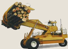
Forestry Harvesters and Skidders

Graco's automatic lubrication system constantly replenishes grease as it's used. Critical wear surfaces are protected and grease seals are maintained, preventing dirt and other contaminants from entering your bearings.