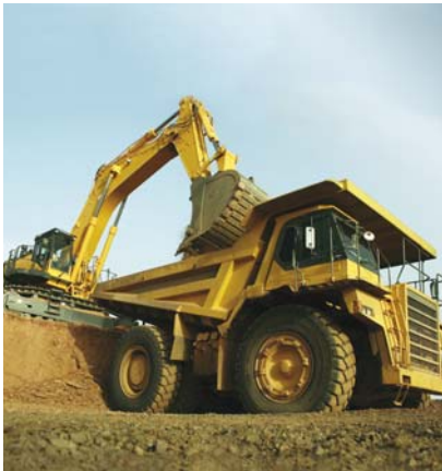
Lubrication you can count on every day

We know how construction and mining equipment can take a beating. Graco's automatic lubrication equipment is just as tough–built to perform in the most rugged environments. Graco automatic lubrication equipment...easy-to-use, dependable and designed specifically for the challenges you face every day.