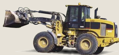
Small- to Mid-Size Vehicles