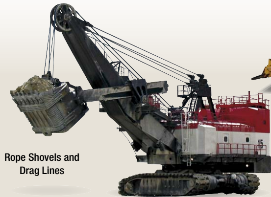
Rope Shovels and Drag Lines

We know how construction and mining equipment can take a beating. Graco's automatic lubrication equipment is just as tough–built to perform in the most rugged environments. Graco automatic lubrication equipment...easy-to-use, dependable and designed specifically for the challenges you face every day.